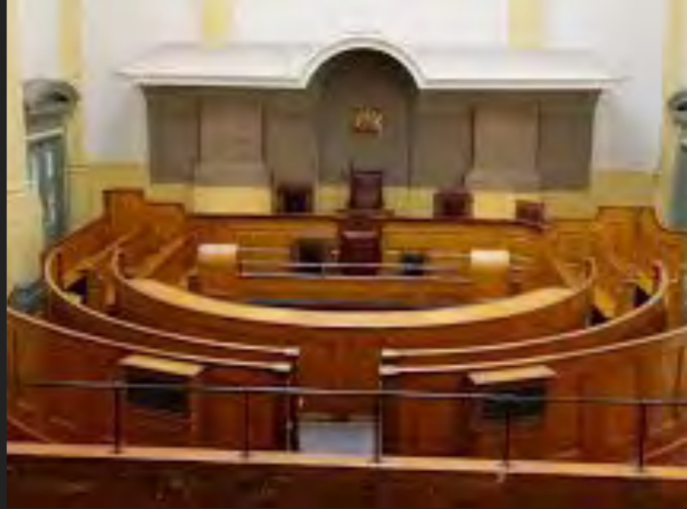
In 1971, the Crown Court was situated in Leeds Town Hall