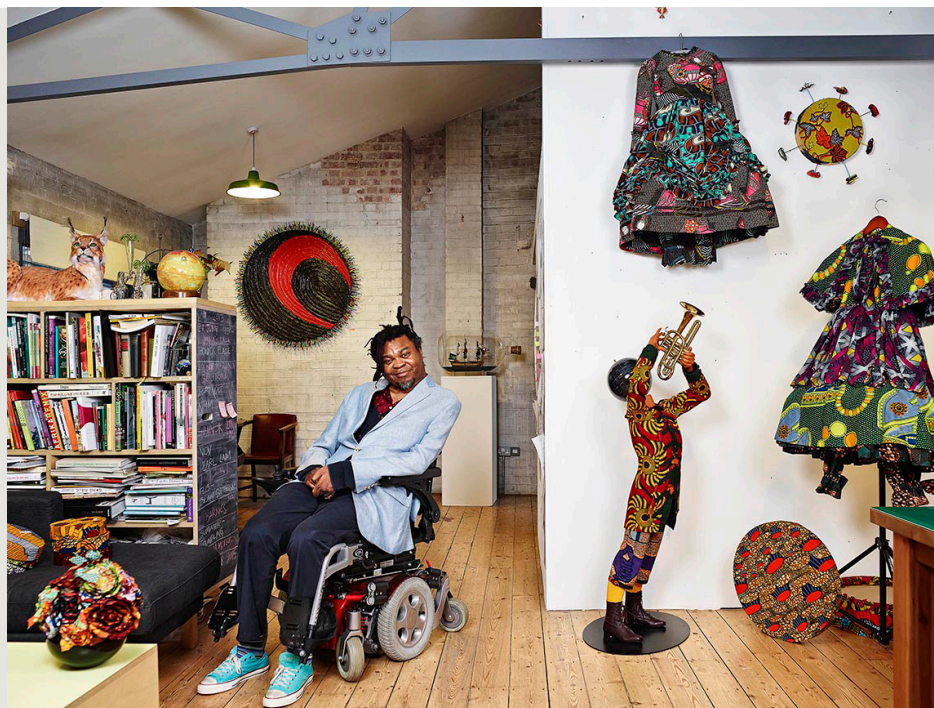
Yinka Shonibare in his London studio.

Yinka Shonibare (born 9 August 1962) is a British-Nigerian artist living in the United Kingdom. His work explores cultural identity, colonialism and post-colonialism within the contemporary context of globalisation. A hallmark of his art is the brightly coloured Ankara fabric he uses. As he has a physical disability that paralyses one side of his body, Shonibare uses assistants to make works under his direction. Yinka Shonibare CBE born 1962 | Tate