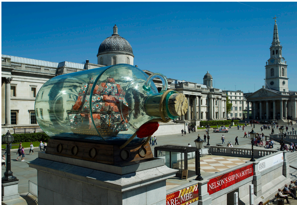
Nelson's Ship in a Bottle

While the commemorative aspects of this artwork are moving and challenging, the project development team intend the piece itself to be a colourful, beautiful celebration of David Oluwale's heritage which will draw visitors and admirers to engage with it. Shonibare's artwork "Ship in a Bottle" sat upon Trafalgar Square's fourth plinth and is now housed at the National Maritime Museum in Greenwich. It is said to be one of the most photographed artworks in London. The Aire Park sculpture is intended to have a similar draw.