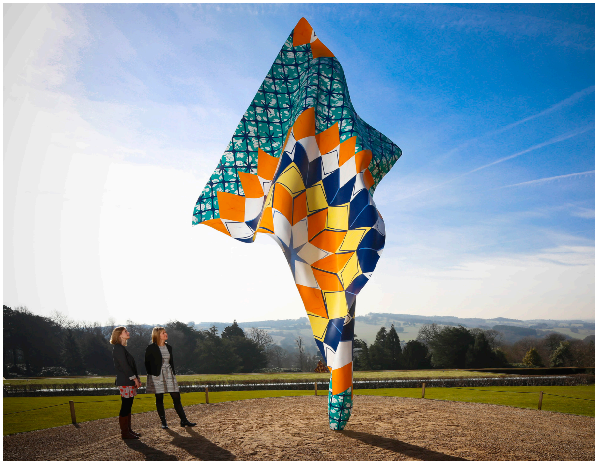
Wind Sculpture II Installation view: Yorkshire Sculpture Park, UK 2013